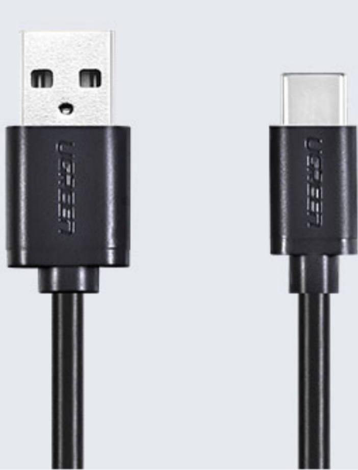
DC-BK-TypeC 1.0 meter Type-C cable