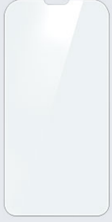
SP-C60 Tempered glass screen protector