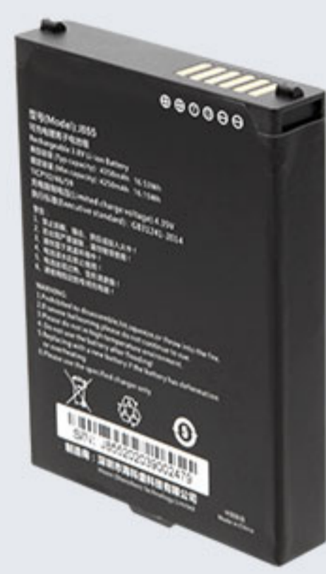
BTRY-C60-43MA 4350mAh Li-ion battery, 3.8V output