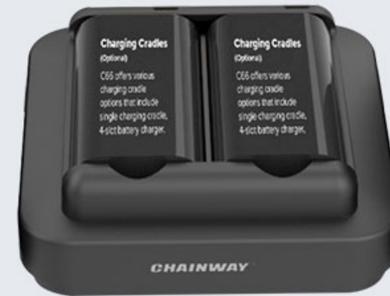
CRD-C61-PBC Charging Cradle for pistol battery, up to 2 slots, use with DCP-WR-12V2A-XX adapter.