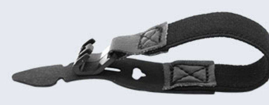
RB-C61-HS hand strap