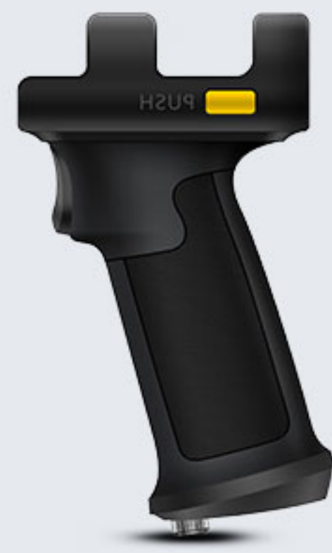
RB-C61-PS Snap-On Trigger Handle, use with optional pistol battery