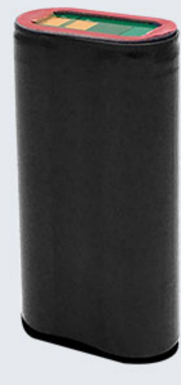
BTY-C61-PB Pistol battery, 5,200 mAh