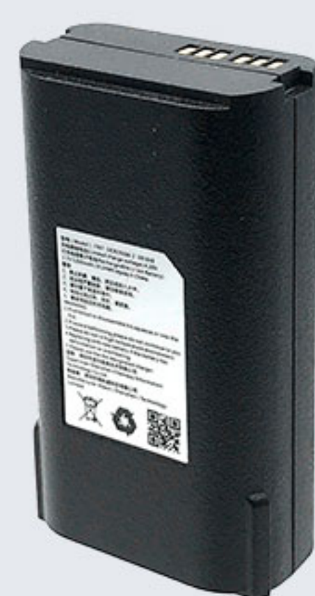
BTRY-C61-67MA 6700mAh Li-Ion battery, 3.8V output