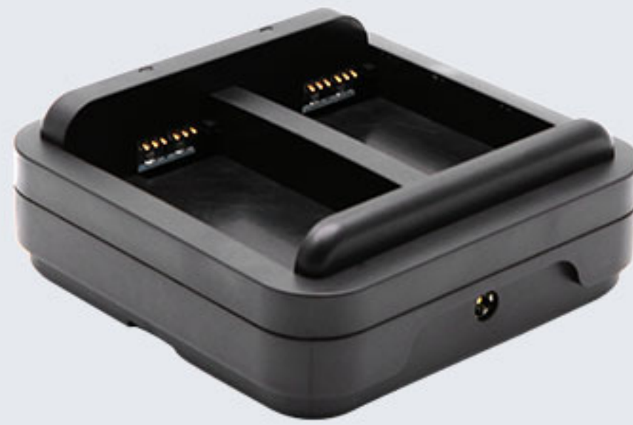
CRD-C61-MBC Charging Cradle for main battery, up to 2 slots, use with DCP-WR-12V2A-XX adapter.