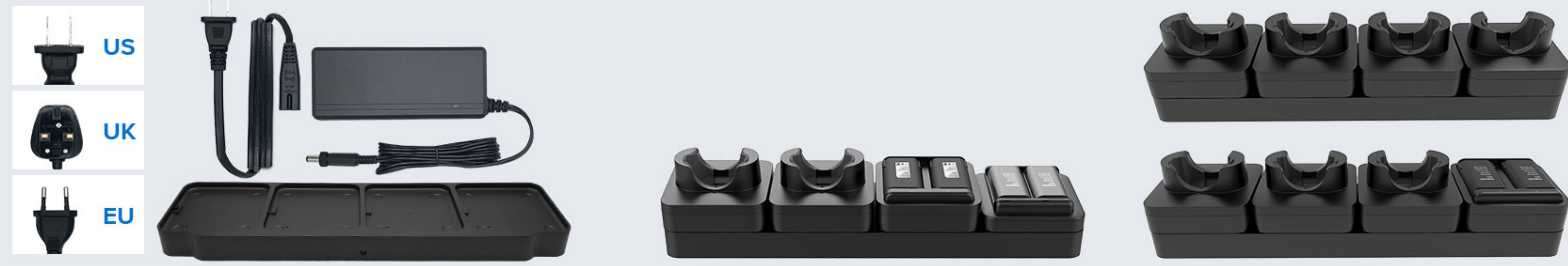
CRD-MCB The base of 4-slots charging cradle set for 4 pieces of cradle, use with DCPWR-12V5A-XX adapter. For load balance, recommendation: 1. 4x cradle for device 2. 3x cradle for device + 1x cradle for main battery 3. 2x cradle for device + 1x cradle for main battery + 1x cradle for pistol battery