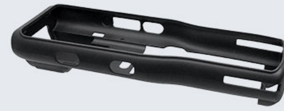
RB-C61-RR Rugged Rubber Boot, omni-directional hand protected. It can coexist with CRD-C61-RBC/CRD-C61-RBCE charging cradle.