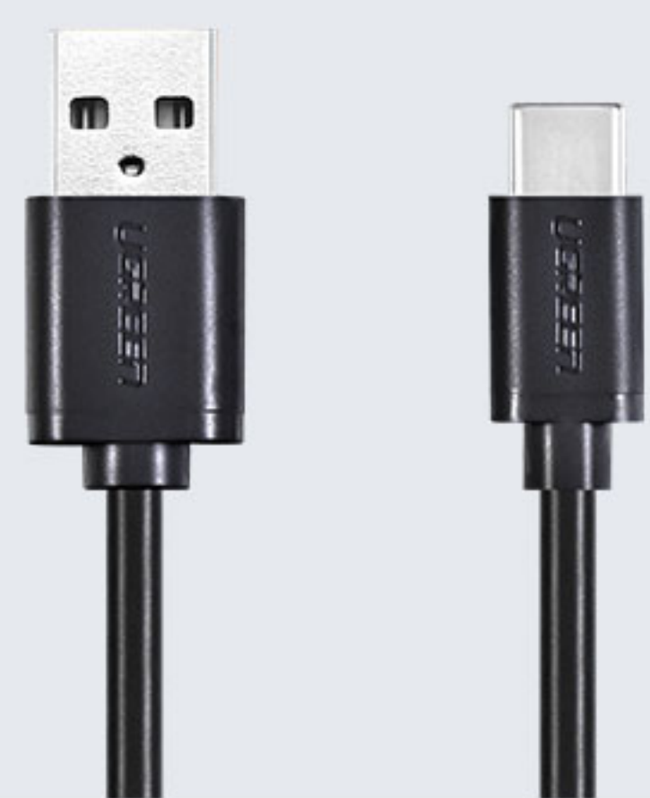
DC-BK-TypeC 1.0 meter Type-C cable